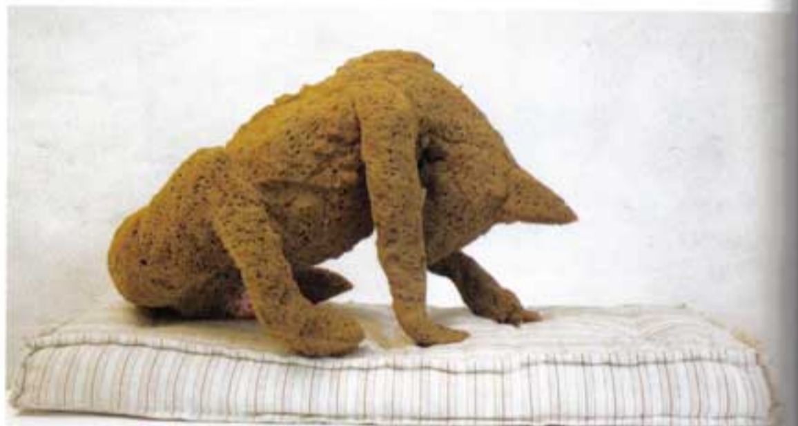
7 & 8 SE FOSSE COSÌ / IF IT WAS LIKE THIS 2007 bronze 9x17x13 /glass 21x13x16 each